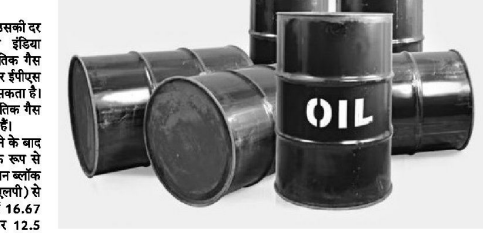
मई में तेल एवं गैस क्षेत्र में रायल्टी की दरें बढ़ते जाने के बाद एक सरकारी ने कुछ फायदों को आंशिक रूप से वापस ले लिया था

ऑयल इंडिया पर ज्यादा असर पड़ेगा क्योंकि इसका उत्पादन जमीन तेल पर (ऑनशोर) होता है। विस्कोकों का अनुमान है कि वित्त वर्ष 2027 में कच्चे तेल की विक्री पर प्रभावी रायल्टी दर 10 डॉलर प्रति बैरल से बढ़कर 13 डॉलर प्रति बैरल हो जाएगी, जिससे ऑयल इंडिया का मुफ़ादा का 4-5 प्रतिशत और इंपीएस 5-6 प्रतिशत घट जाएगा। इस बीच, हाइड्रोकार्बन अन्वेषण और लाइसेंसिंग नीति (एनएलपी) के तहत बनाई गई नई कैटेगरी के फोर्ड आभी भी हैं। इनके लिए