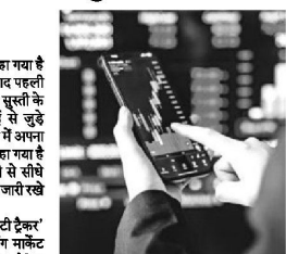
ग्लोबल इमर्जिंग मार्केट (जीईएम) फंडों से लगातार छह इन्फंडों में 10 अरब डॉलर की निकारी हुई है

क्यापिटल इन्वेस्टि फंडो और सीमाती मालुओ फंडो में भी बड़ी मात्रा में पैसा बाजार निकला है। इलारा ने कहा, 'कुछ मिलाकर, वे रुझान बताते हैं कि एआई इन्फ्रास्ट्रक्चर और क्रोमिक थैरेपी इकोसिस्टम में बढ़े पैमाने पर टॉप-डाउन निवेश