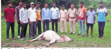
Forest Department officials with villagers and carcass of the bullock